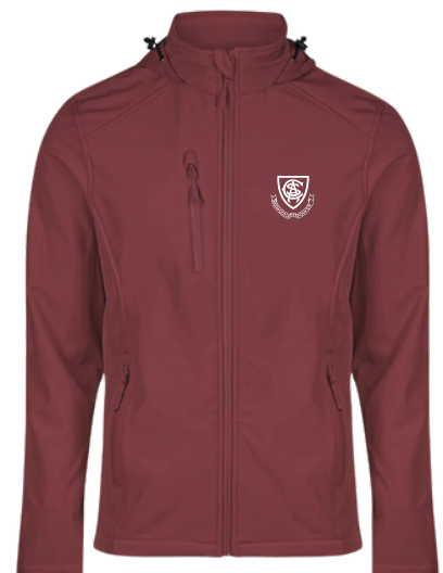
Winter Jacket $75