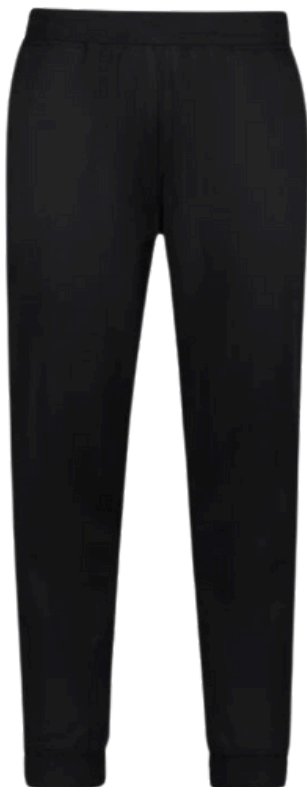
Track Pants $40