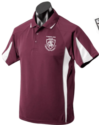
Polo shirt $35

Order by phone or directly from the website