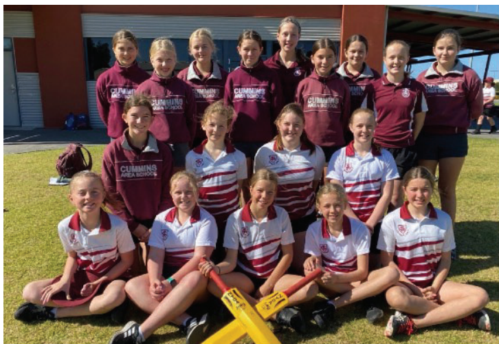
Girls T20 Cricket Teams