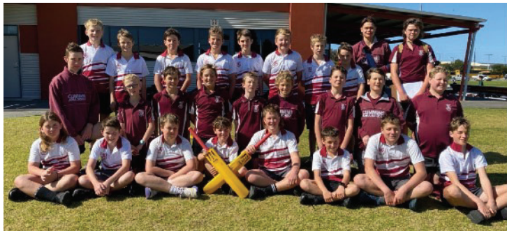
Boys T20 Cricket Teams

On Thursday, 16 th September boys and girls in Year 6/7 travelled to Ravendale Oval in Port Lincoln to compete in the annual T20 Cricket Carnival. With 14 cricket fields set out on the 2 footy ovals at Ravendale, the smaller cricket fields ensured high scores by many teams. Short boundaries saw many 4's and 6's hit. Cummins had three boys teams with 26 boys involved. The boys did exceptionally well, winning all of the 11 matches they played, with the Cummins 2 Team averaging 205 runs, Cummins 1 averaging 184 runs and Cummins 3 Team averaging 153 runs. Year 9 students Hugh Redden, Ezra Foster and William Turner coached the three boys teams.